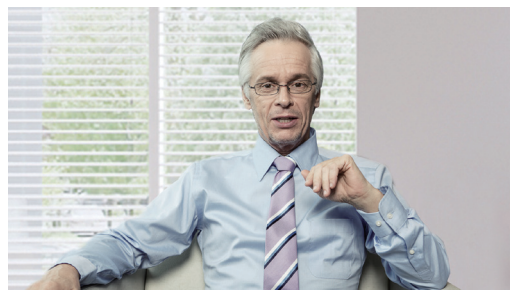
Yealink VC Desktop under 30% packet loss